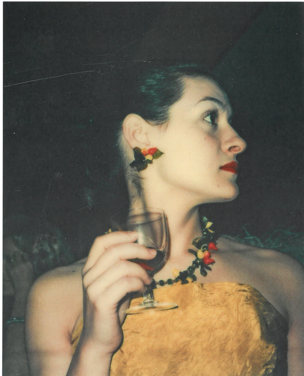
Andy Warhol, "Paloma Picasso," 1983, Polaroid type SX-70, 10.8 x 8.8 cm.