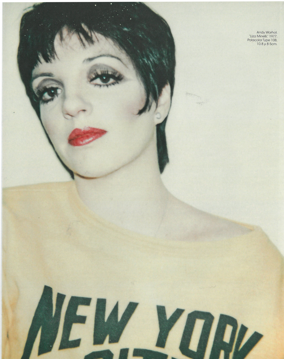
Andy Warhol, "Liza Minelli," 1977, Polacolor Type 108, 10.8 x 8.5cm.

BOTH IMAGES © 2018 THE ANDY WARHOL FOUNDATION FOR THE VISUAL ARTS, INC., LICENSED BY DACS, LONDON. COURTESY BASTIAN, LONDON