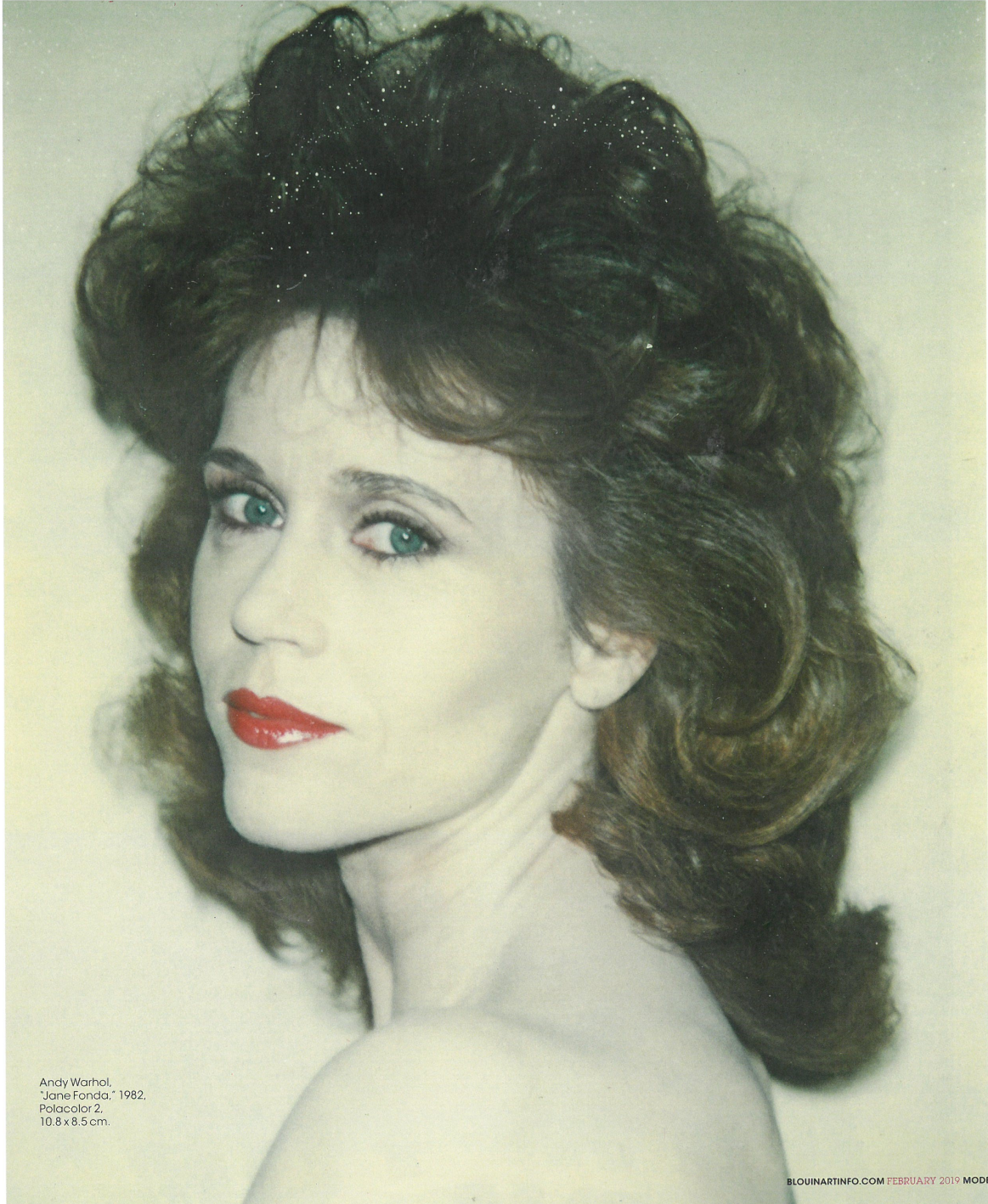
Andy Warhol, "Jane Fonda," 1982, Polacolor 2, 10.8 x 8.5 cm.