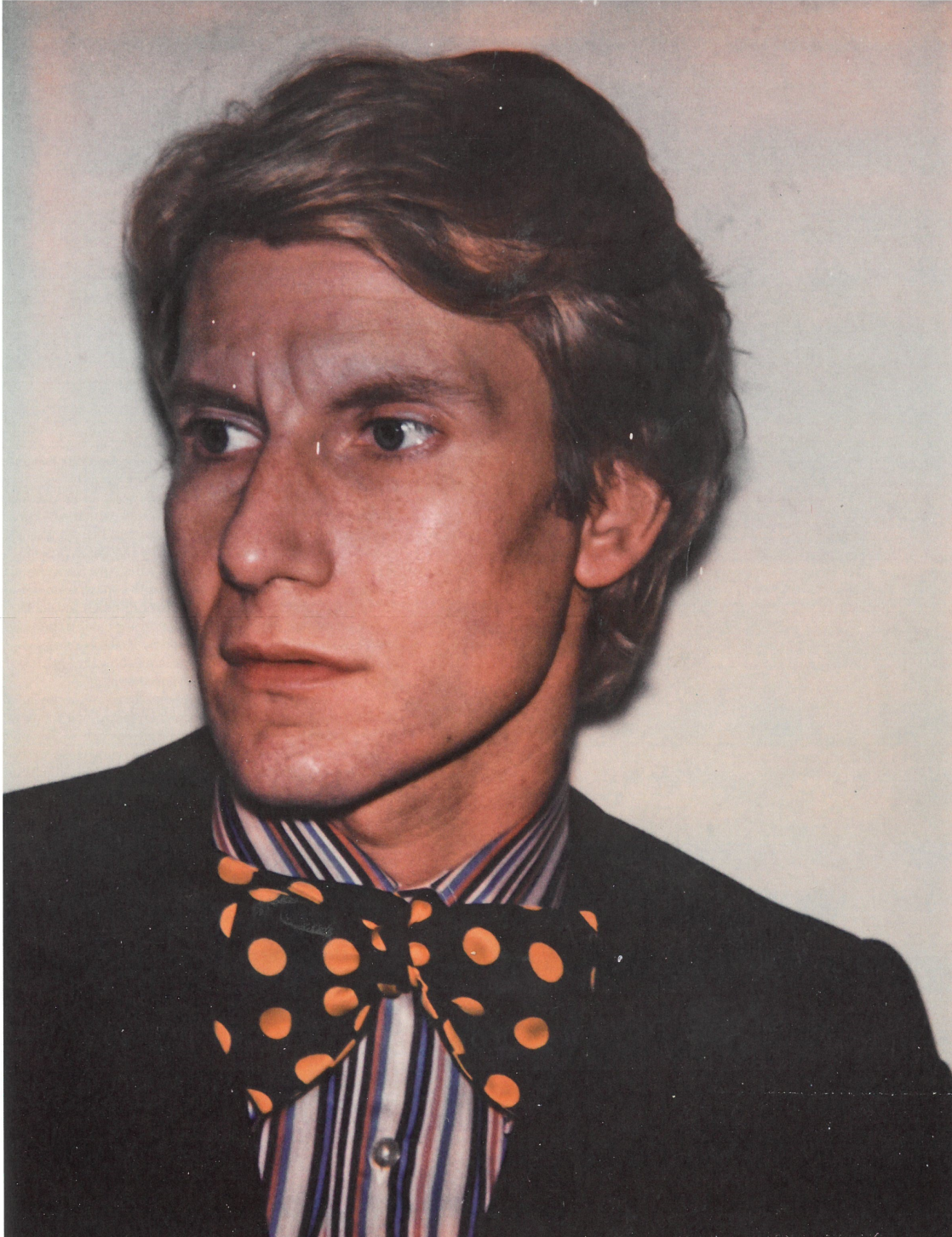
Andy Warhol, "Yves Saint- Laurent," 1972. Polacolor Type 108, 10.7 x 8.5 cm.