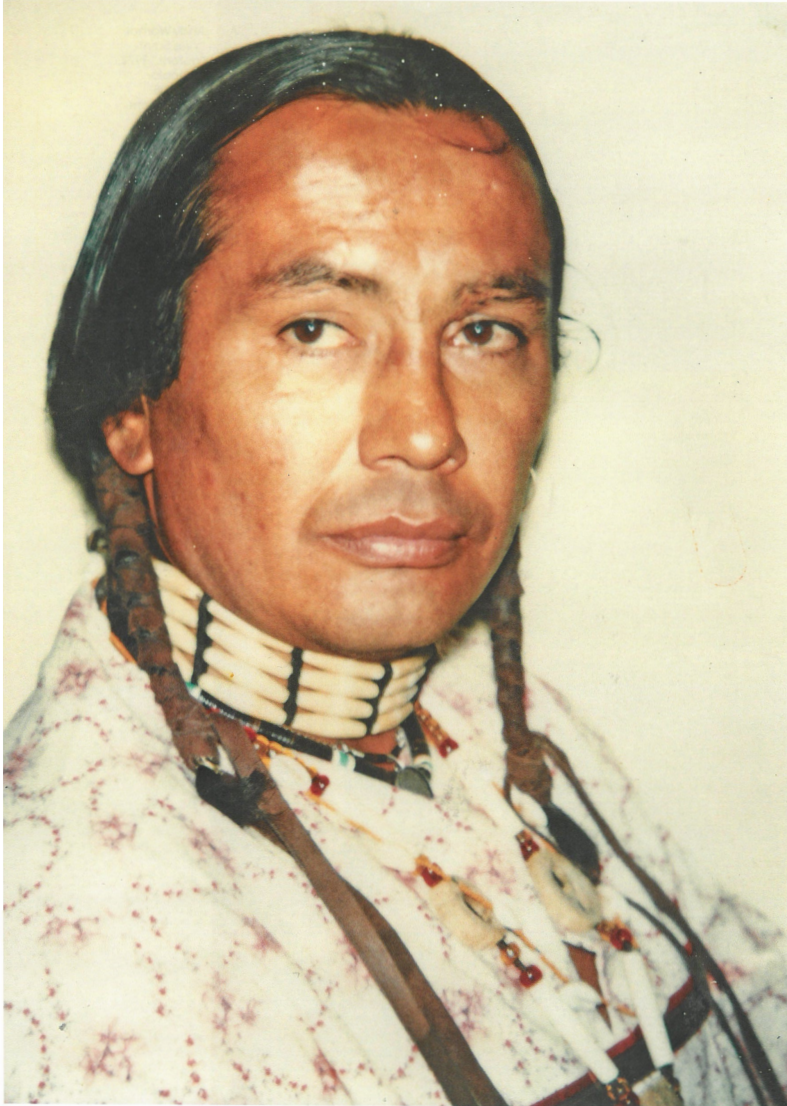
Andy Warhol, "The American Indian (Russell Means)," 1976. Polacolor Type 108.

globalized." Indeed, Bastian noted: "Many more international key players have emerged; Asia has become a significant force and continues to grow rapidly."